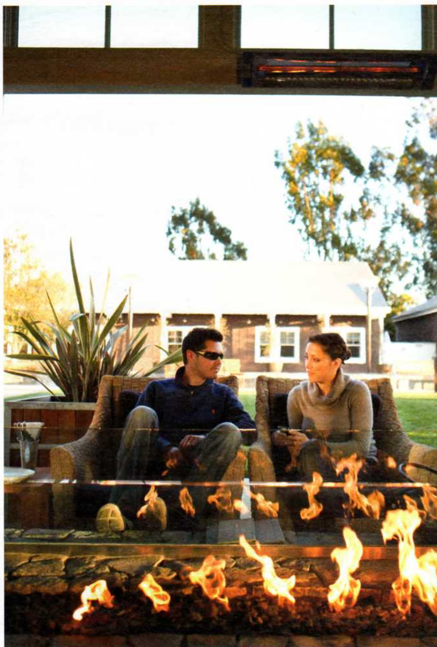
With an outdoor lounge and seasonal menu, Farm sets a rustic tone. The 300-plus-selection wine list er sought-after local producers along with some well-chosen bottles from around the world.

Solage Calistoga, 755 Silverado Trail, Calistoga Telephone (707) 226-0850 Web site www.solagecalistoga.com/dining/index.shtml Open Breakfast, lunch and dinner, daily Cost Entrées $19-$33 Corkage $20 Credit cards All major