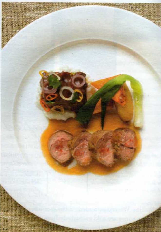
The eclectic and well-executed menu at Bardessono includes entrées such as this and curry-braised lamb with coconut basmati rice, pineapple and quince.