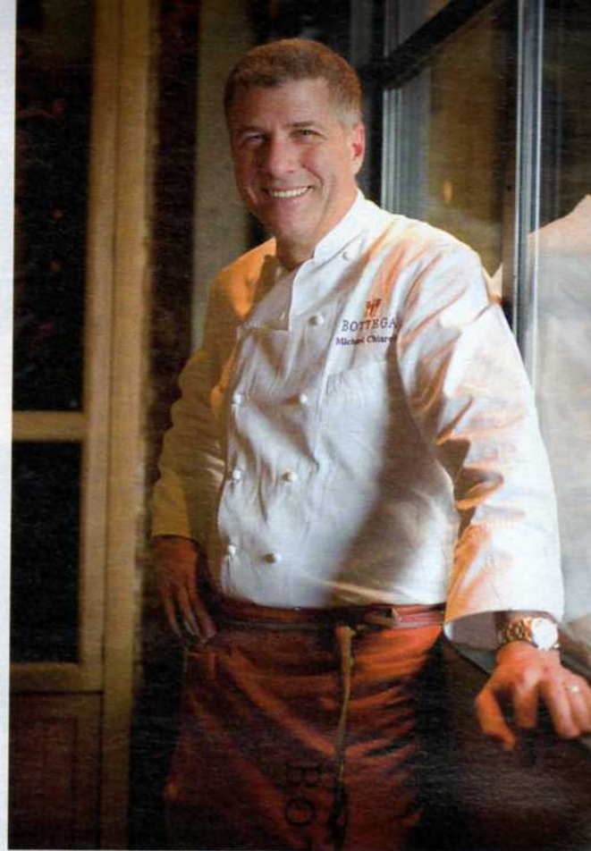
Chef Michael Chiarello is a culinary dynamo. The founder of Tra Vigne, he now cooks in the kitchen at his new Italian-themed hot spot Bottega, in Yountville.

Michael Chiarello is back where he loves to be—behind the stove—at his new restaurant, Bottega. The cookbook author, vintner and Food Network celebrity, who describes the restaurant as his new studio, is picking up where he left off 10 years ago at Tra Vigne, exploring regional Italian themes with a California twist. You'll find a few carryovers from Tra Vigne, such as whole oven-roasted fish, wood-grilled octopus,